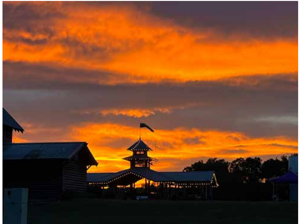
An incredible sunset view of the Triple Tree Aerodrome facility from the 2022 Youth Masters Event.